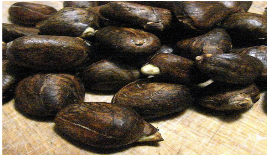
Figure 1: Breadfruit seed

The bread fruit, Treculia African , is known in Nigeria and other countries such as Senegal, Sudan and Angola. Treculia African is of the family moraceae and is native of the East Indies. It is generally cultivated in the tropics and its tree is 40-50ft high. As in the mulberry, female flowers grow together to form one large fleshly mass, the so-called fruit, which is roughly spherical and is about 6 in diameter. It is mark with hexagonal knobs, corresponding to separate fruitless, and is yellow when ripe. The seeds as shown in figure 1 below from the fruit are edible and are of high nutritional values<sup>1</sup>. It seed is said to contain oil of about 20.83% when fully extracted<sup>2</sup>.