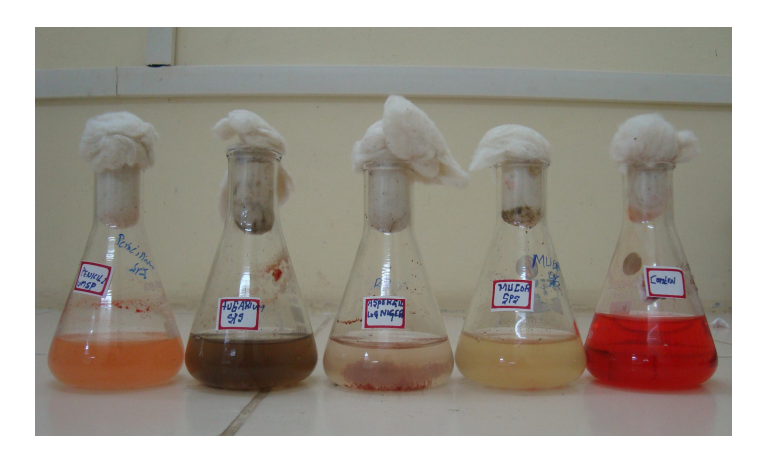
Figure.2 Remazol Red the maximum decolorization was given by the fungi Aspergillus niger (95.9%)

Figure 1. microbes isolated from textile soil sample were characterized and identified.