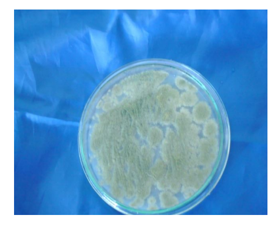
f) Aspergillus flavus