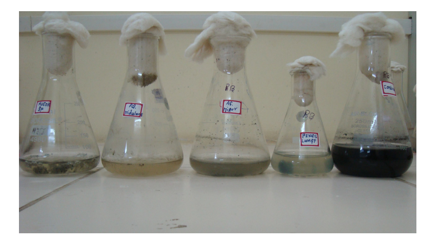
Figure.3 In Remazol Black Aspergillus flavus (96.4) shows effective decolorization compare to other fungal species.