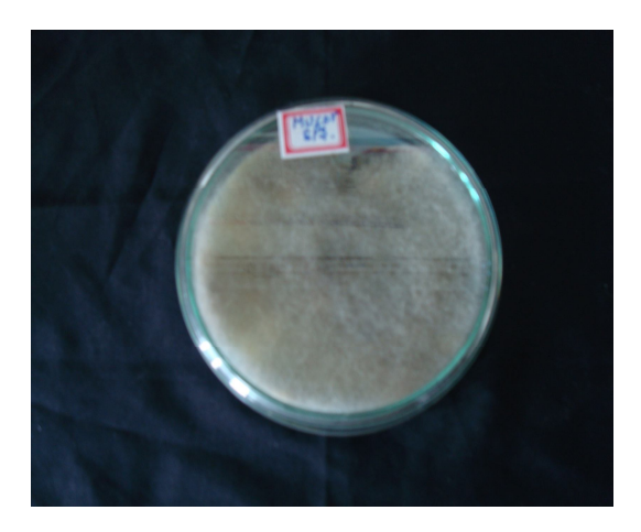
i) Trichoderma species