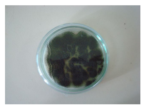
a) Aspergillus niger