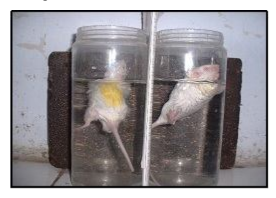
Figure 1- Forced swim test in rats (Porsolt et al., 1978)

A widely used classic model for antidepressant activity is the forced swim test (FST) as described earlier <sup>19, 20</sup>, one of the despair-based models which were proposed to have relatively good predictive validity for monoamine-based antidepressants <sup>12</sup>.