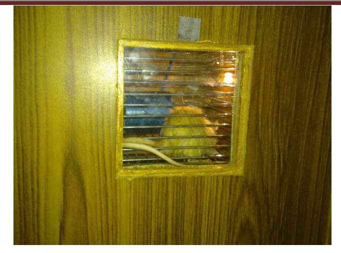
Figure 5- Learned helplessness (Maier et al., 1976; Overmier et al., 1967)

This model is reported to have a good predictive validity including alterations in hypophyseal-pituitary axis (HPA) activity and rapid eye movement (REM) sleep characteristic of depression and can be used as an additional screening procedure but the model is time consuming and its specificity is questionable. Other problems with this model are that the changes persisted for only a couple of days, reducing ease of method use and the need to repeatedly administer shocks that has contributed to its unfavourable image, even unacceptable by ethics committees in some countries.