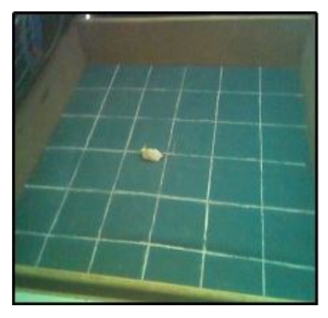
Figure 4-Open field activity in mice (Bhattacharya, 1993)

Based on this, previous studies have shown that three weeks of exposure to electric shocks, immersion in cold water, immobilization, reversal of the light/dark cycle followed by session of exposure to loud noises, bright lights and variety of other stressors when followed immediately by an open field test, showed increase in open field activity and the effect, which was not observed in chronically stressed animals <sup>37, 38, 40</sup>.