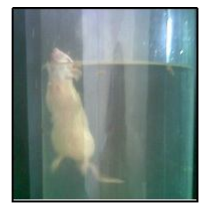
Figure 2- Chronic fatigue test (Kaur et al., 2000)

The model is based on the premise that, when rats or mice are forced to swim in narrow cylindrical apparatus from there is no escape, after an initial period of vigorous attempt to escape, they adapt a characteristic immobile posture in which they remain floating in water making only those movements necessary to keep their head above the water level. The immobility exhibited by rodents reflects the state of "despair" as they resign themselves to the experimental conditions, which is taken as an index of depression.