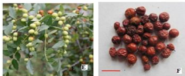
Figure 1: The Ber (Fruits) used in the study

Reactive oxygen species (ROS) are generated spontaneously in body tissues during different metabolism process and are associated with the progression of different degenerative diseases, such as heart diseases, brain stroke, liver damage, rheumatoid arthritis, diabetes, cancer and oxidative stress. Free radicals mutually with other derivatives of oxygen are predictable by products of genetic redox reactions. The powerful toxicity of synthetic antioxidants has aroused interest and scientists have paying attention on isolation of natural antioxidants from natural sources such as spices, herbs, seeds, fruits, cereals and vegetables by extraction, purification and fractionation 2, 6 . Ziziphus is a genus containing 135 species of shrubs which are spiny in nature and also including small trees. Its fruits possess considerable levels of antioxidant coup, reducing power, scavenging result on free radicals. Its fruits are used for several other disorders such as tumors and cardiovascular disease associated to the production of radical spices resulting from oxidative pressure. Consequently, medicinal plants can be a potential base of natural antioxidants 8 .